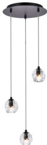
Black Item No:3505D12BK