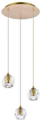
Glod Item No:3505D12G